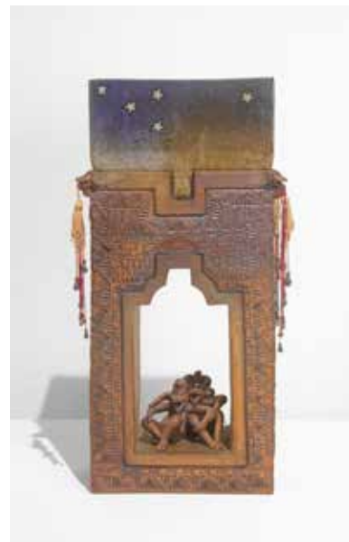
William Wilhelmi, Azcapotzalco , 1977, stoneware and tassels, 15" x 7.5" x 4.5", Permanent Collection of the Art Museum of South Texas

P.S. Unfortunately, shoes are still required when you come for a Museum visit, no matter the temperature outside! #PartyPooper