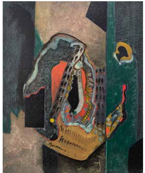
Top: Everett Spruce, Sand Piper , n.d., oil on board, Gift of the Art Museum of South Texas 2021 Collectors Club